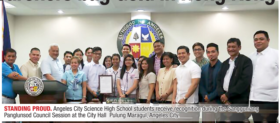
STANDING PROUD. Angeles City Science High School students receive recognition during the Sangguniang Panglungsod Council Session at the City Hall Pulung Maragul, Angeles City.