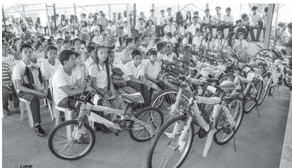
WHEELS FOR EDUCATION. Stakeholders donate bicycles to the students of Sto. Domingo Integrated School and Cuayan Elementary School. The said bikes are being used by the students in going to school instead of commuting in public utility vehicles.

Part of the mission of the Department of Education is to encourage stakeholders to actively engage and share responsibility in developing life-long learners. To achieve its mission, collaboration in the community is needed. Assistance must be given to students to motivate them to go to school.