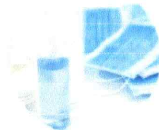
Hygiene packs (soap, alcohol, masks etc.)