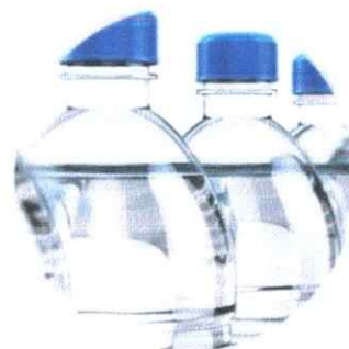
Bottled water and hydrating fluids