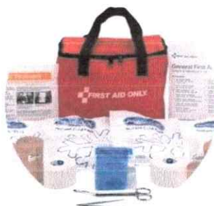
Medical Aids (Band-aids, gauze, disinfectant, medicines etc.)