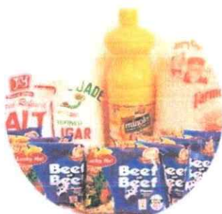
Ready-to-consume goods such as easy open canned goods, biscuits, water, instant noodles, instant coffee and etc.

*note: We do not accept donation of clothes to avoid in contact with Covid-19*