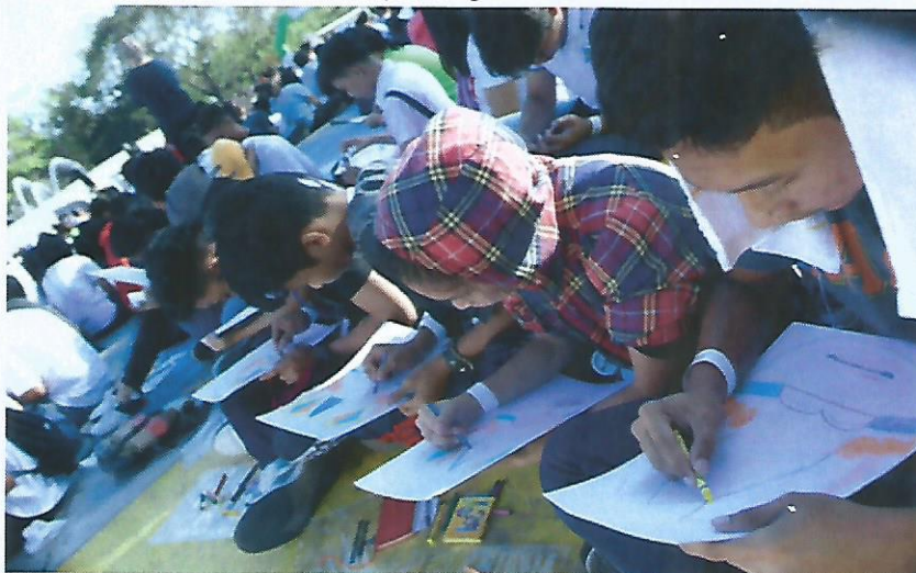
Students actively participating in the Art Lesson