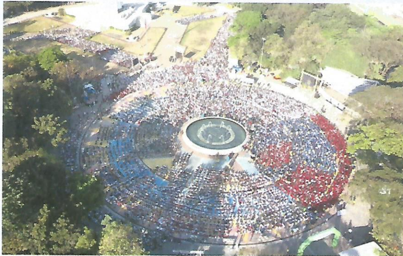
Aerial Shot of the 16,692 participants

ATTACHMENT 1: PINASayang Sining: World Largest Art Lesson pictures